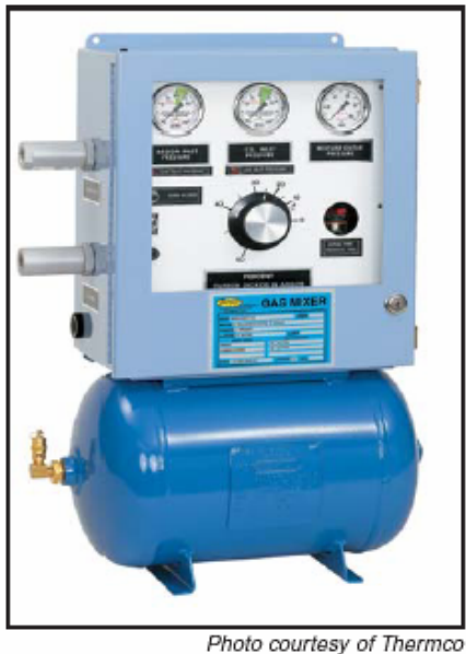
Surge Tank Gas Mixer: Surge tank style gas mixers operate with a surge tank, solenoid valve, and pressure switch.

Surge tank gas mixers are usually more expensive than constant flow type gas mixers, but have the significant advantage of maintaining an accurate proportion down to zero flow. Consider the example of a welding application. At some point no welding shield gas demand will exist, perhaps during break time or overnight. The great majority of piping systems and/or welding machines have some leakage. If this leak rate falls into the range where the constant flow gas mixer is inaccurate, for example 0-10 SCFH, a bad mixture will be created and the pipeline will be filled with this incorrect mixture. Defective welding will result when production resumes.