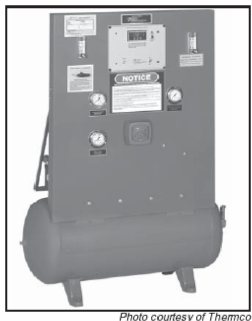
Surge Tank Gas Mixer with Analyzer: Combining the surge tank gas mixer and a gas analyzer creates a system which is accurate over the entire flow spectrum.

observes the result on the gas analyzer. The other important benefit of a gas analyzer is the continuous monitoring of the gas mixture quality. If a process problem should develop, for example a problem with the MIG welding, the operator can observe the analyzer and see if the problem concerns the mixed gas. Any mechanical failures in the gas mixer or loss of supply pressure will be apparent from the analysis of the gas analyzer. Alarms can also be part of the gas analysis system which will provide audio and visual indication to the user when there is a mixing problem. Also, some users require continuous monitoring for quality assurance which can be provided with an optional 4-20 mA output signal to a data logging system.